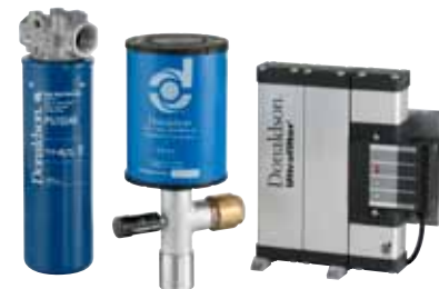
P570248 T.R.A.P.™ ARV™